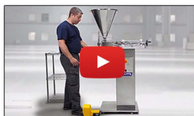
VP-1 S LIQUID FILLER FOR SEMI-VISCOUS LIQUIDS & CREAMS