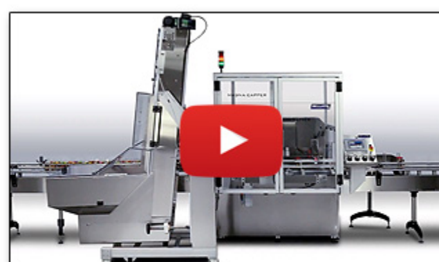
MAGNA CAPPER WITH CAP SORTING ELEVATOR