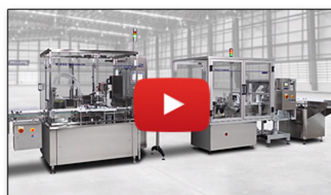
MONOBLOC LINE - FILLING, PLUGGING, CAPPING & LABELING