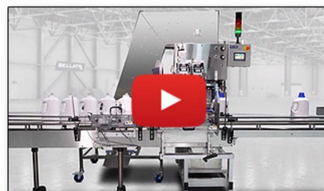
PRIMER CAPPER DISH & LAUNDRY SOAP APPLICATION