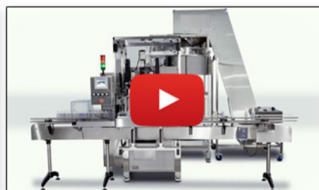
CPC CAPPER FOR COSMETICS & PERSONAL CARE