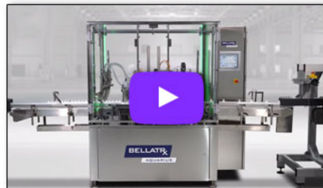
AQUARIUS MONOBLOC SERVO FILL-PLUG-CAP-TORQUE

Ask about our featured equipment queue – available for quick delivery