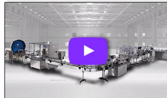
LIQUID PACKAGING LINE TINCTURES, CBD, VITAMINS & SUPPLEMENTS