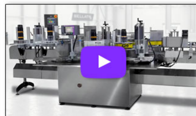
NOTARIS 2-HEAD LABELER ORIENTATION - TAMPER EVIDENT SEAL