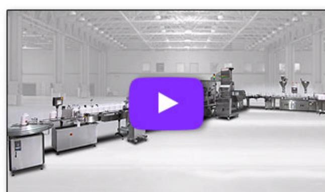
POWDER LINE FOOD - NUTRACEUTICAL

Ask about our featured equipment queue – available for quick delivery