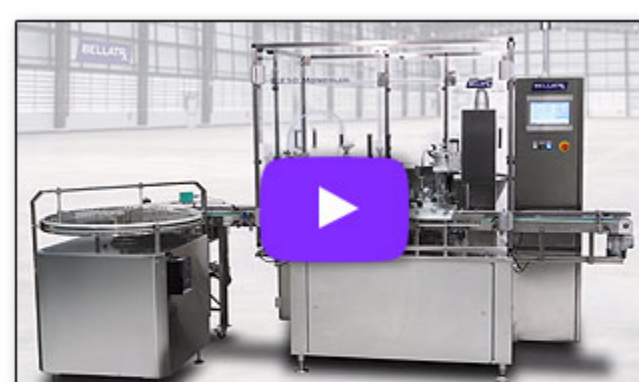
AQUARIUS MONOBLOC LIQUID IN VIALS - PHARMA