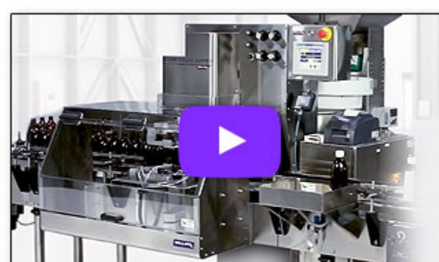
SECURE CHUCK CAPPER LIQUID - DIAGNOSTICS