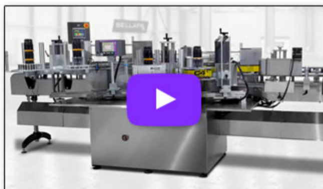
NOTARIS 2-HEAD LABELER ORIENTATION - TAMPER EVIDENT SEAL