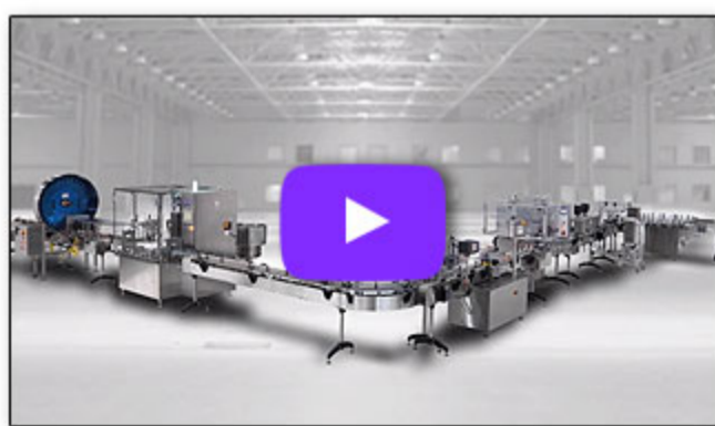
LIQUID PACKAGING LINE TINCTURES, CBD, VITAMINS & SUPPLEMENTS