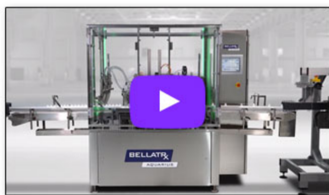
AQUARIUS MONOBLOC SERVO FILL-PLUG-CAP-TORQUE